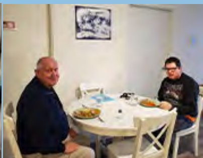
A Happy Easter