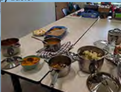
Support Workers facilitated a 'socially distanced' Easter Dinner.