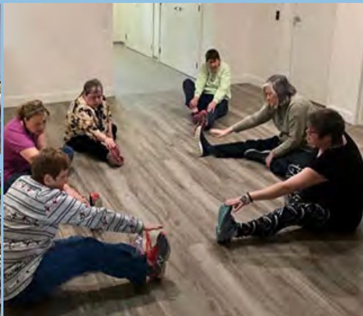
An 'at home' exercise class led by a Support Worker